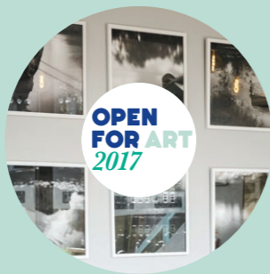
Designed by cream-design.co.uk