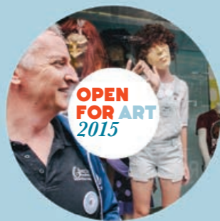
Designed by cream-design.co.uk